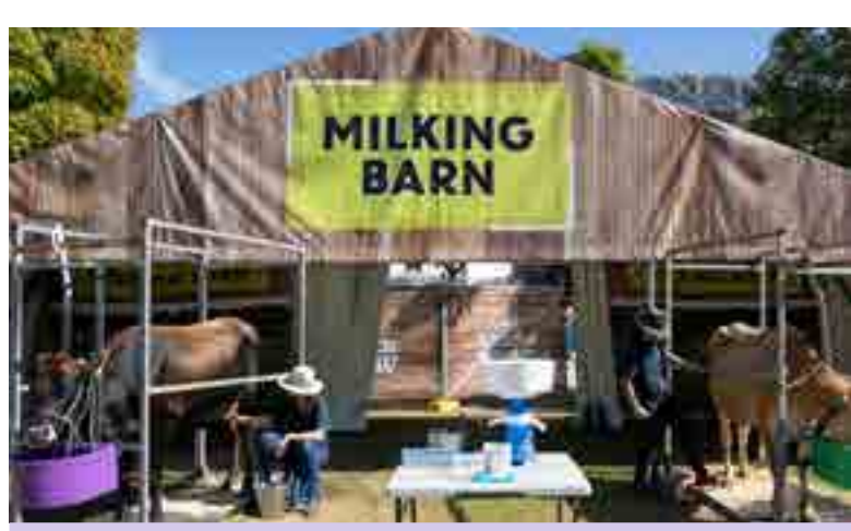
THE MILKING BARN