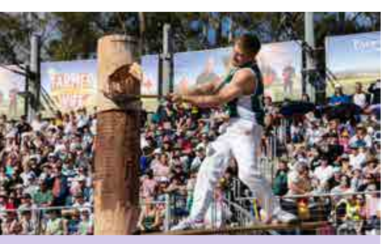
CHANNEL 7 WOODCHOP STADIUM

CLICK ON THE IMAGES TO VIEW SHORT VIDEOS OF THE SPONSORSHIP OPPORTUNITIES.