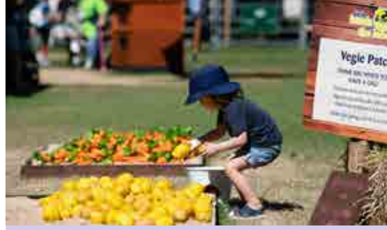
LITTLE HANDS ON THE LAND