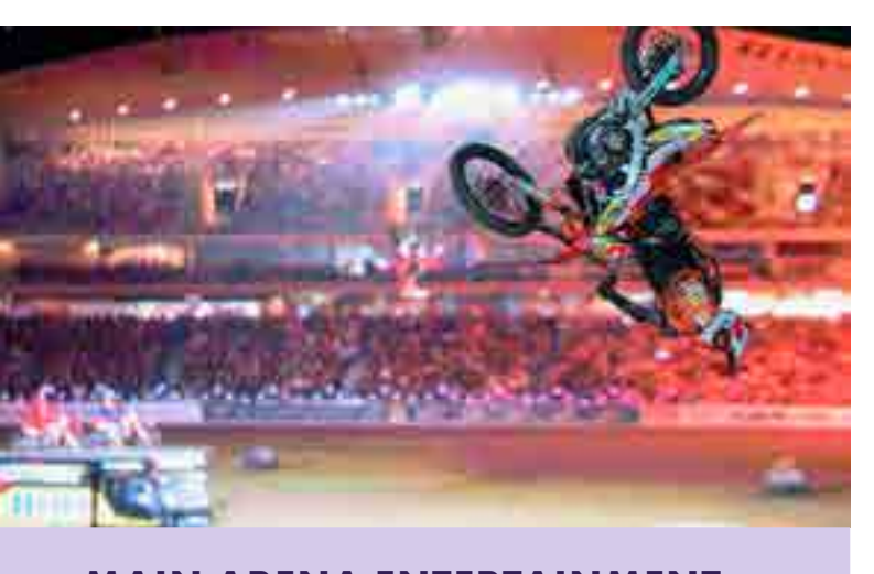
MAIN ARENA ENTERTAINMENT