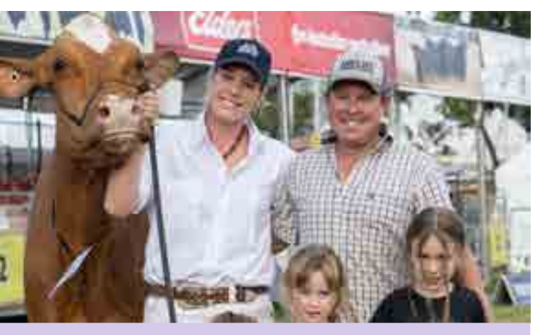
AGRICULTURAL COMPETITIONS SHEEP, HORSE, CATTLE, POULTRY