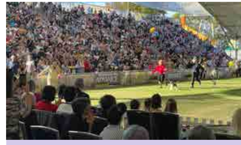
ADVANCE™ SYDNEY ROYAL DOG SHOW