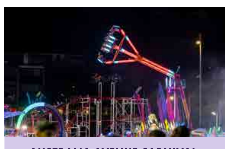
AUSTRALIA AVENUE CARNIVAL